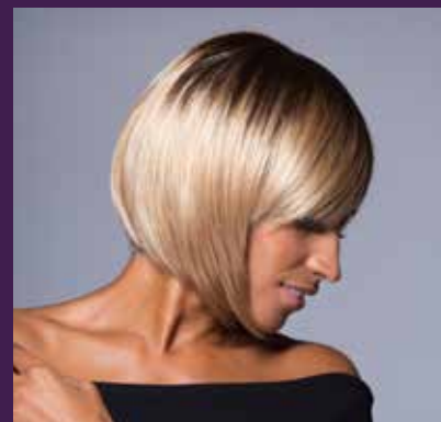
CODI Amore Collection