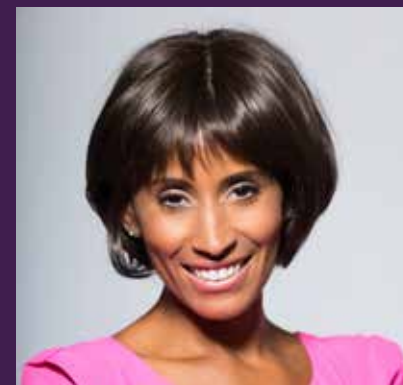
ERIN Amore Collection