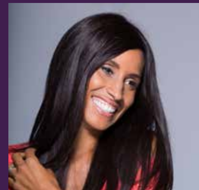
AMBER Gem Human Hair Collection