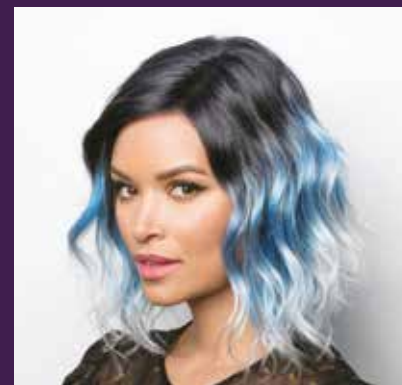
EVANNA Hi Fashion Collection