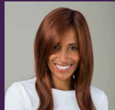
BLUEBELL Sentoo Lotus Collection