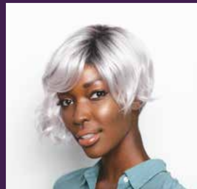
VEE Alexander Couture Collection