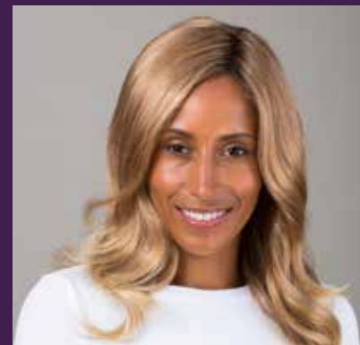
POPPY Sentoo Lotus Collection