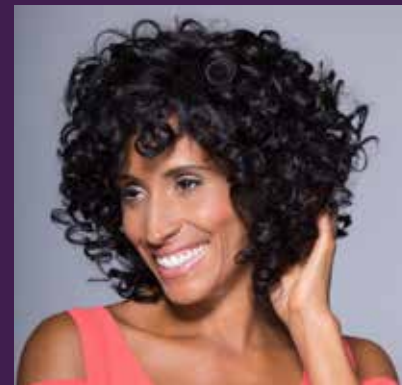
CALLIOPE Ellen Wille Stimulate